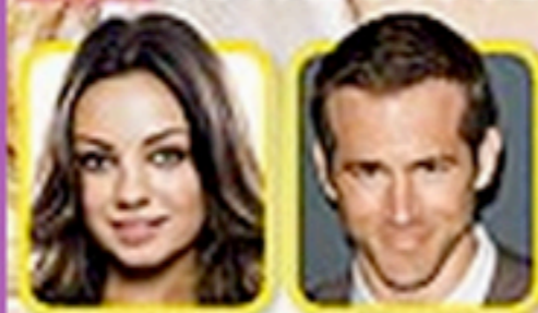
JENNIFER LOPEZ BEVERLY HILLS, CALIF. APRIL 4, 2001